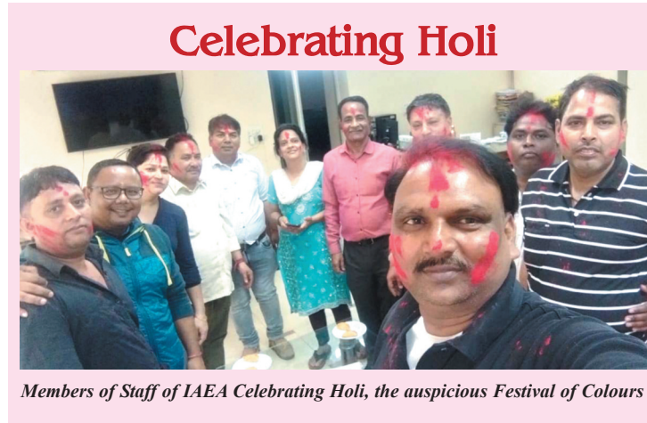
Members of Staff of IAEA Celebrating Holi, the auspicious Festival of Colours